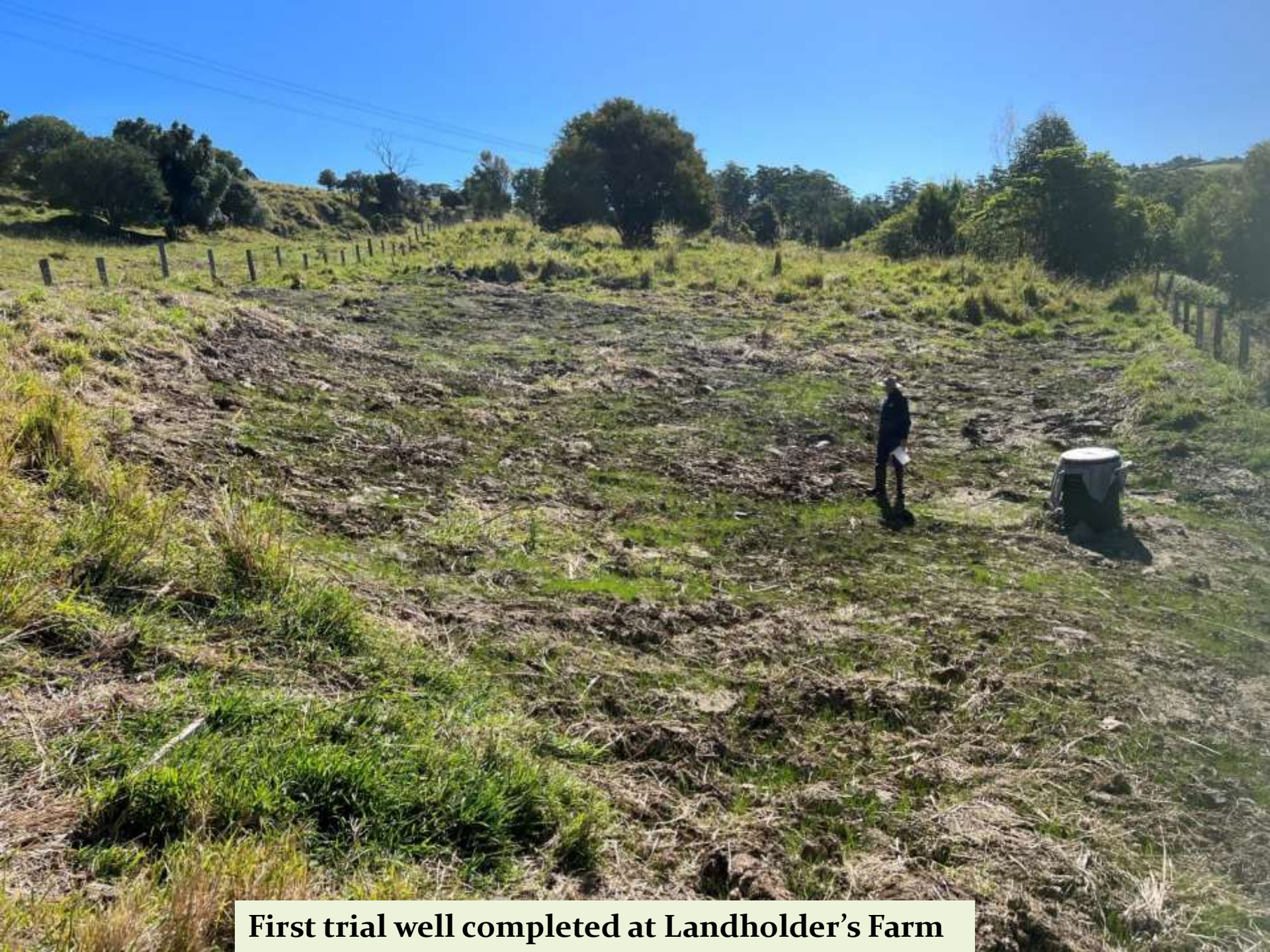
First trial well completed at Landholder's Farm