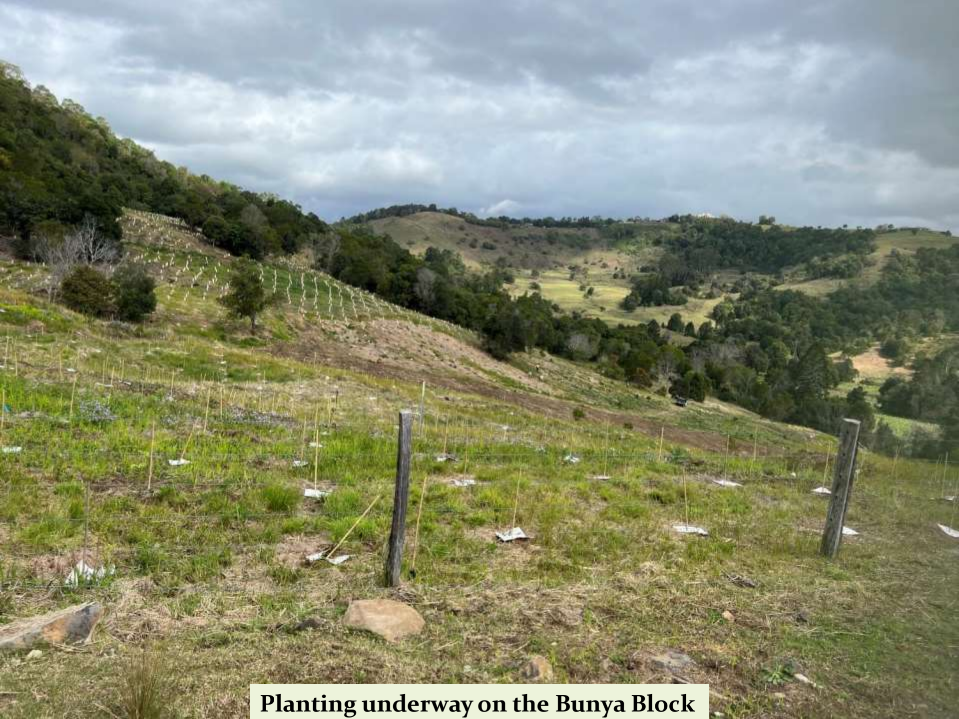
Planting underway on the Bunya Block