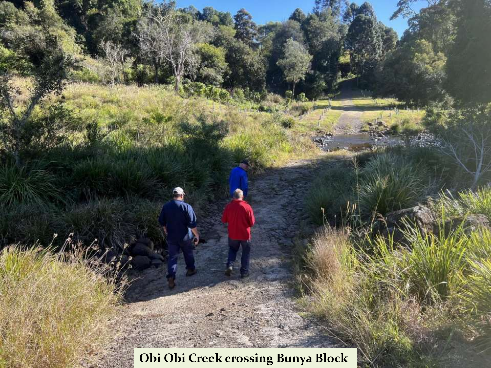
Obi Obi Creek crossing Bunya Block