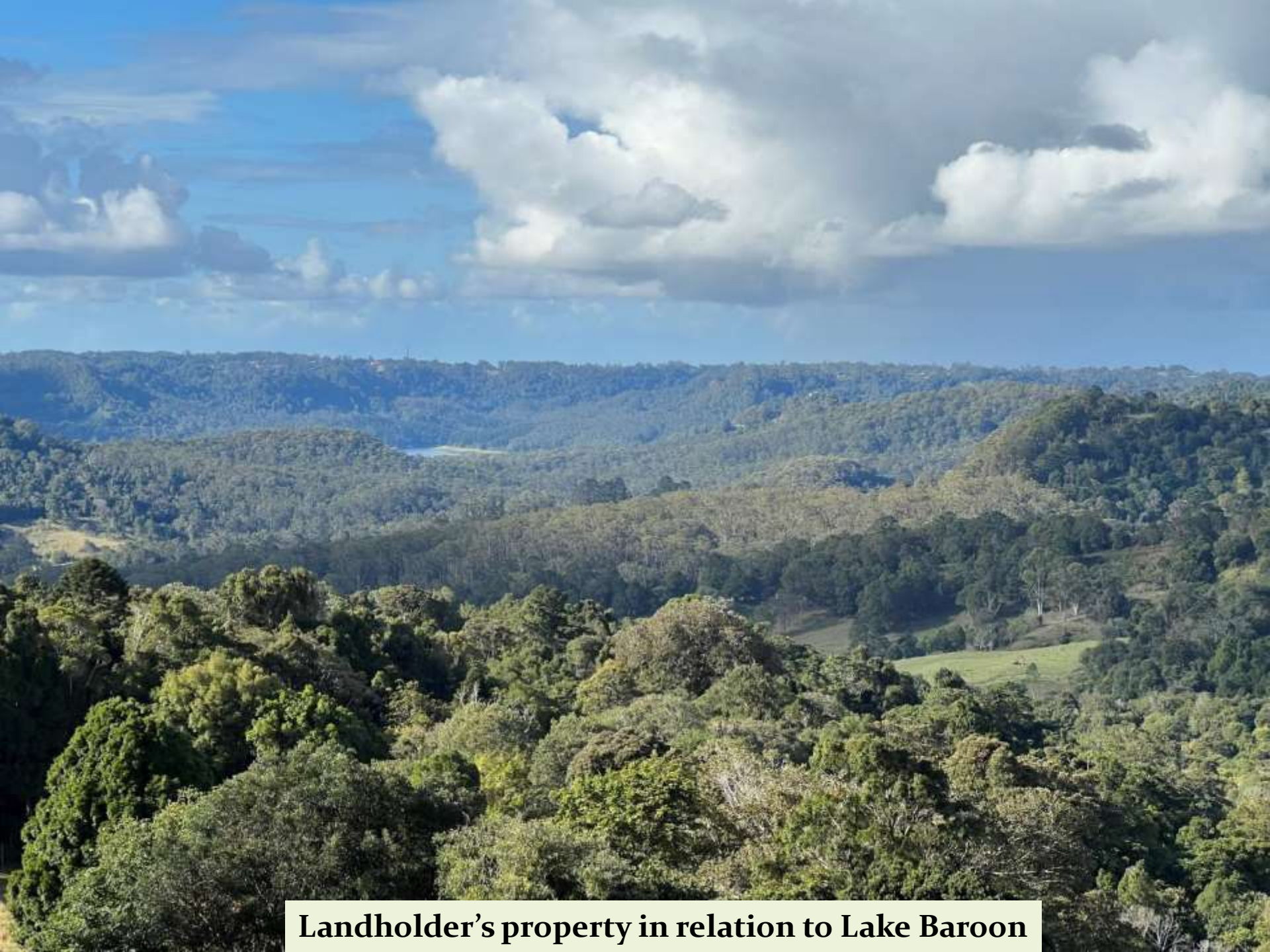
Landholder's property in relation to Lake Baroon