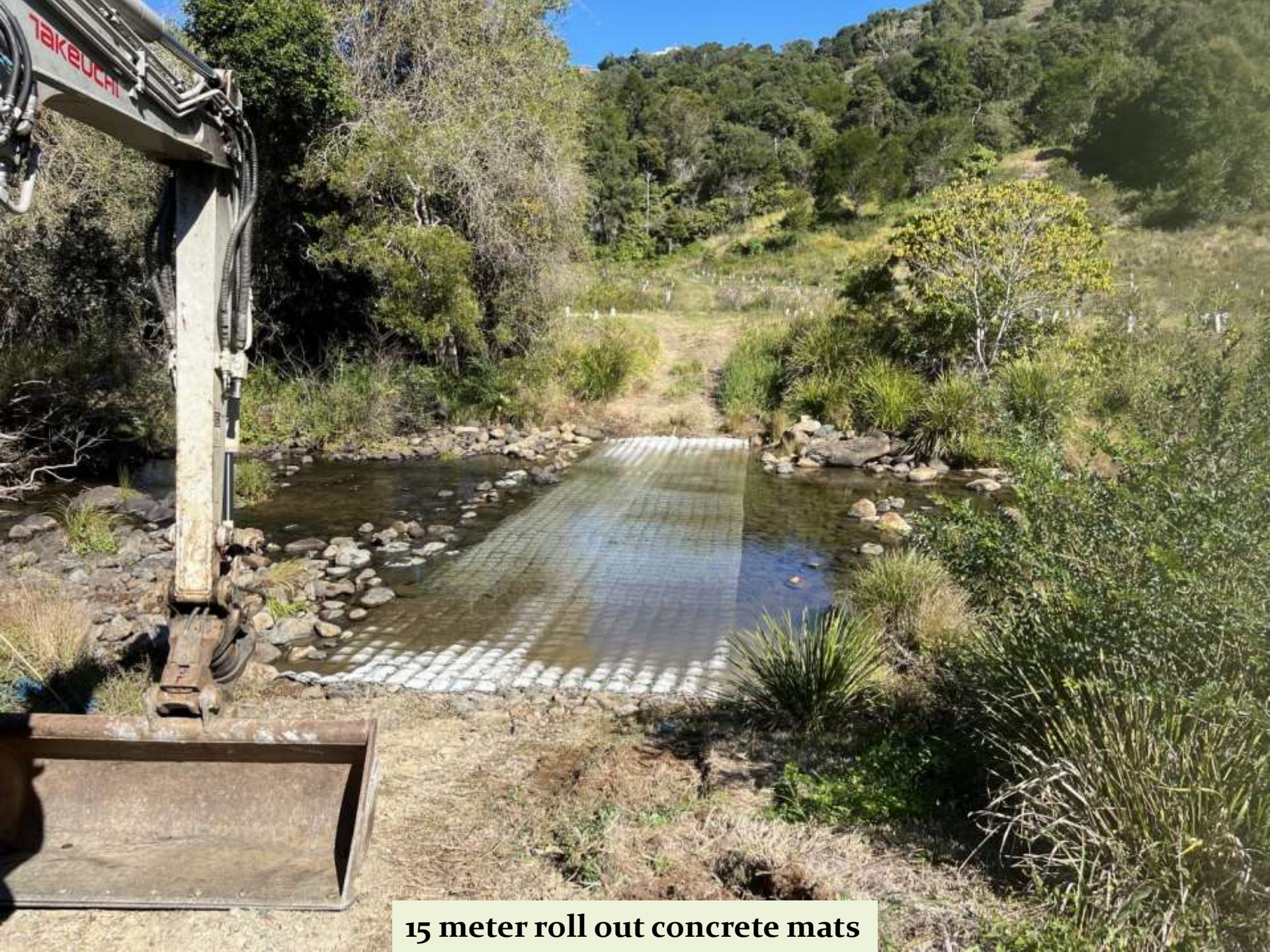
15 meter roll out concrete mats