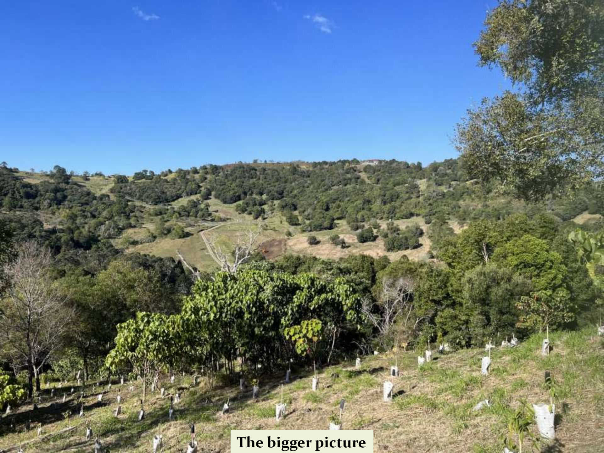
The bigger picture