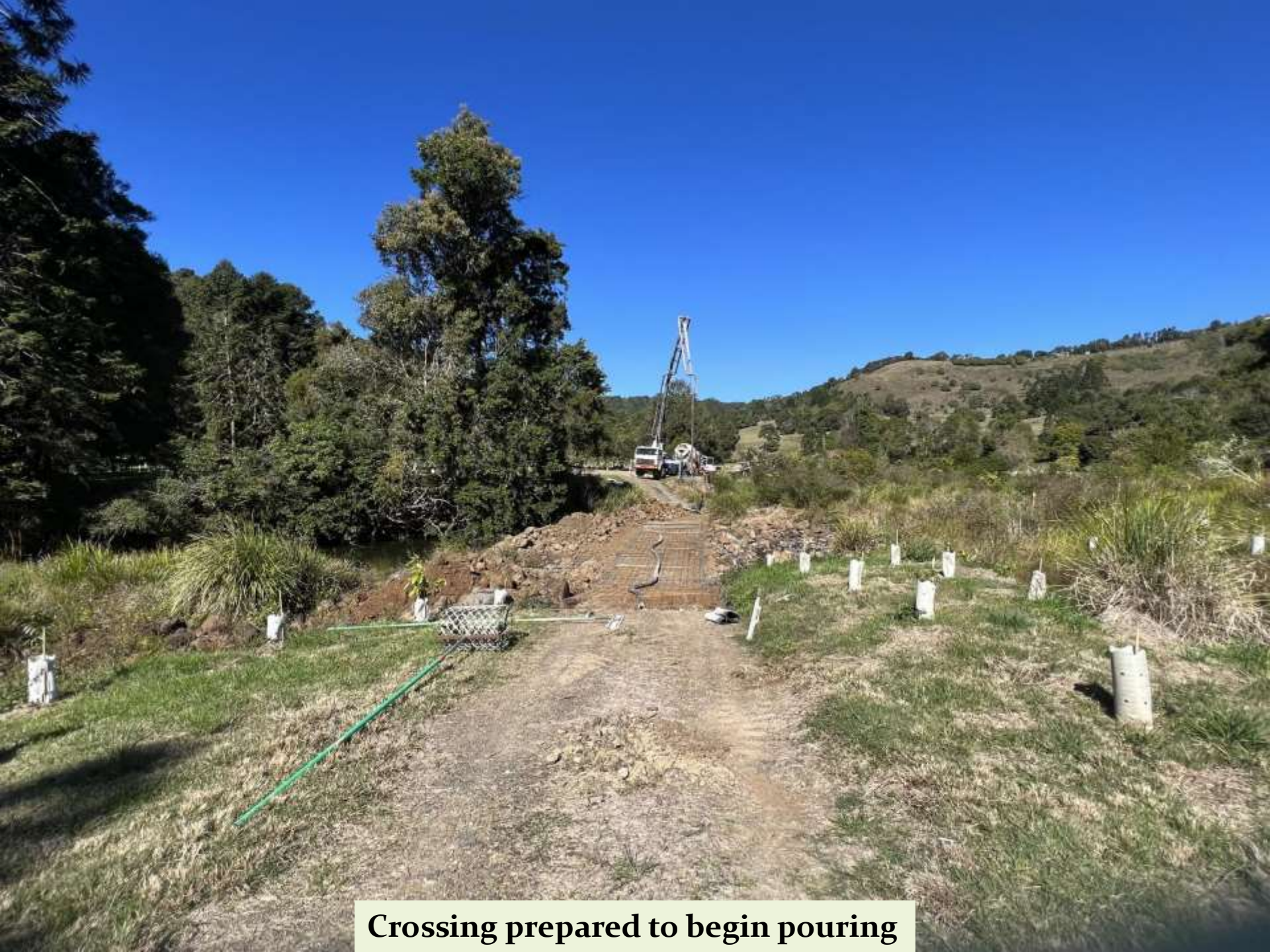
Crossing prepared to begin pouring