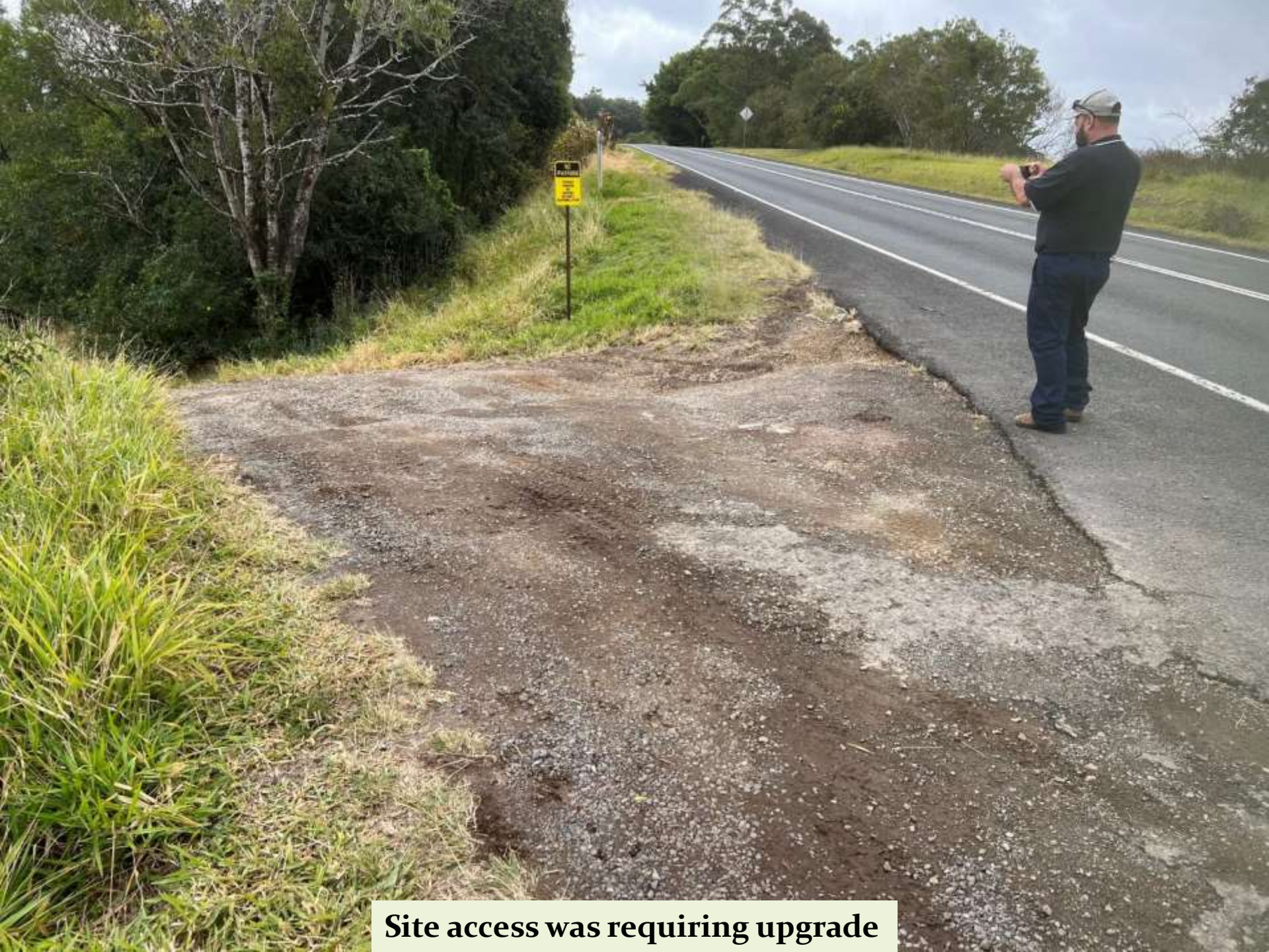
Site access was requiring upgrade