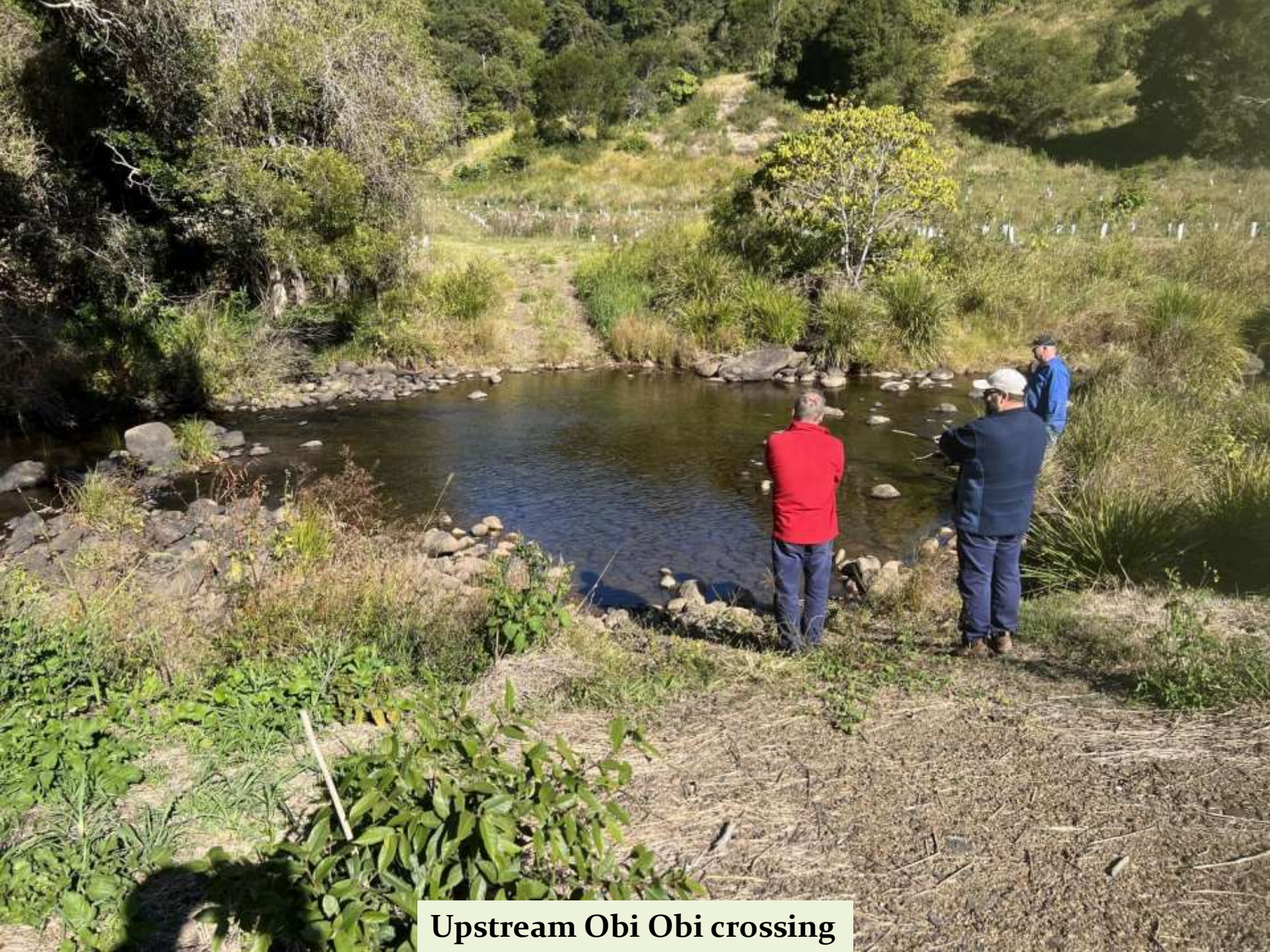
Upstream Obi Obi crossing