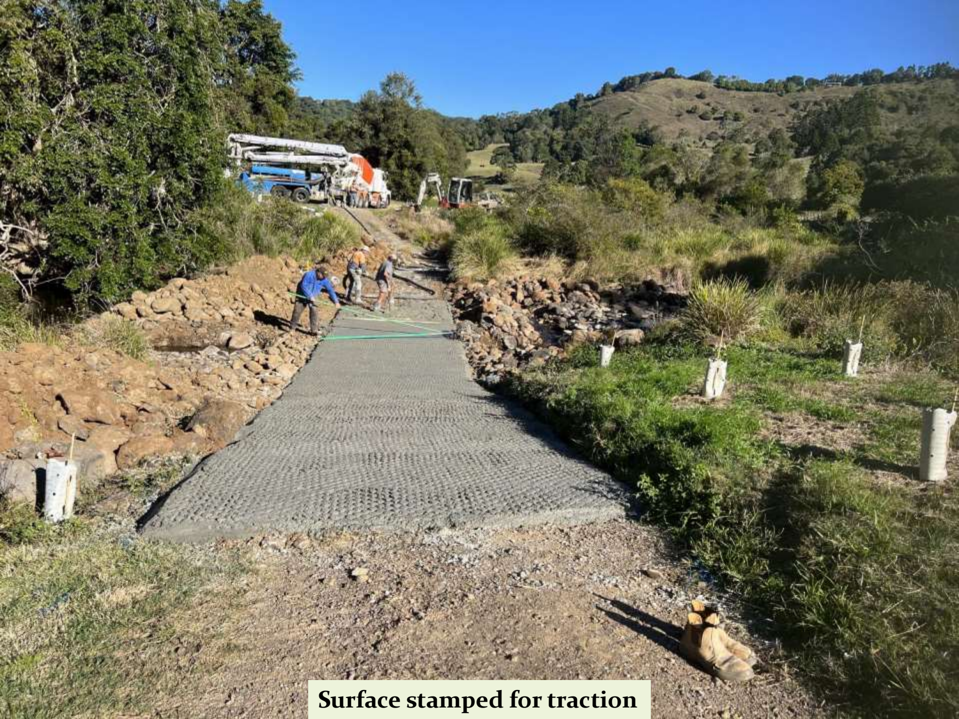
Surface stamped for traction