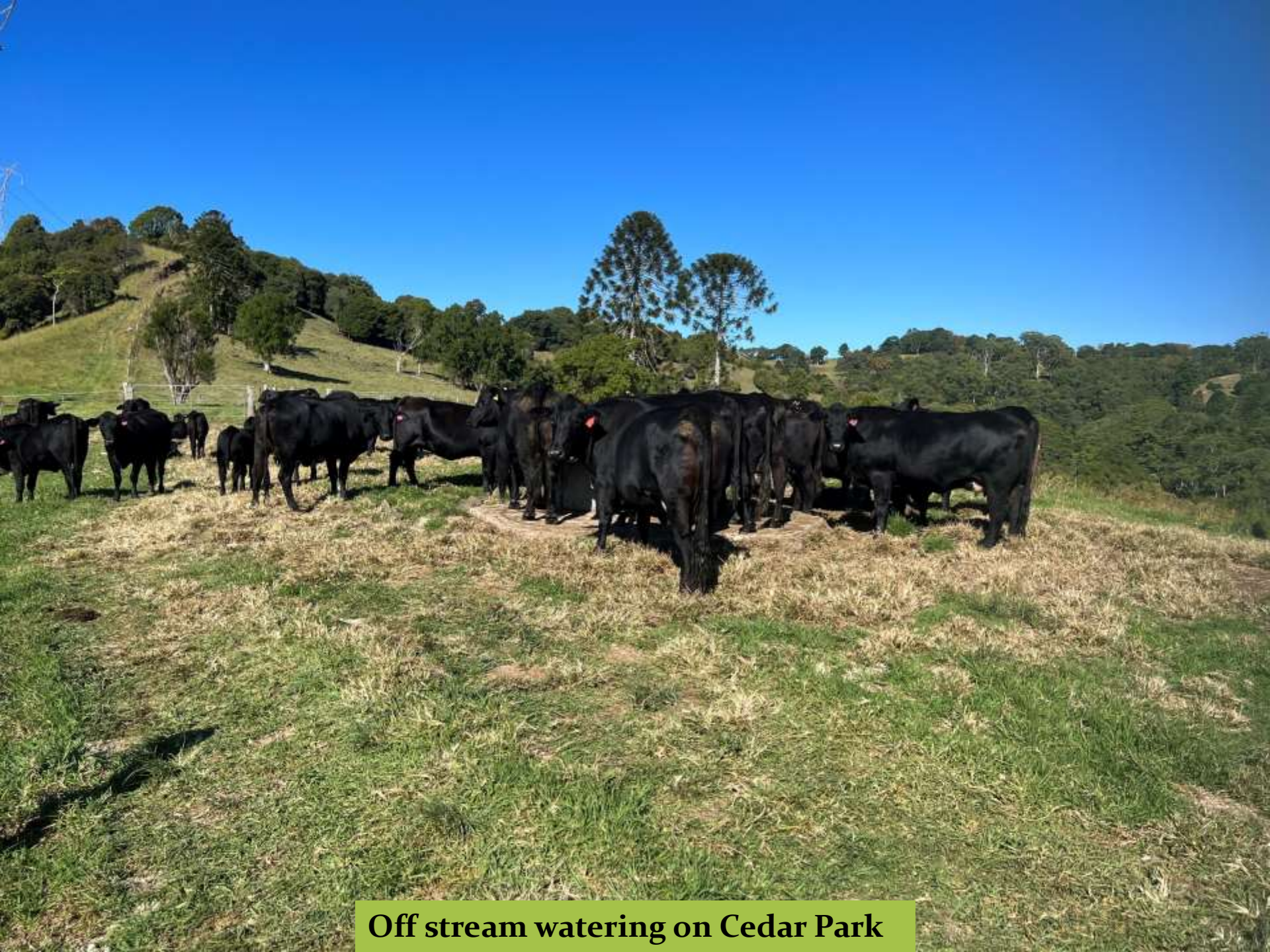
Off stream watering on Cedar Park