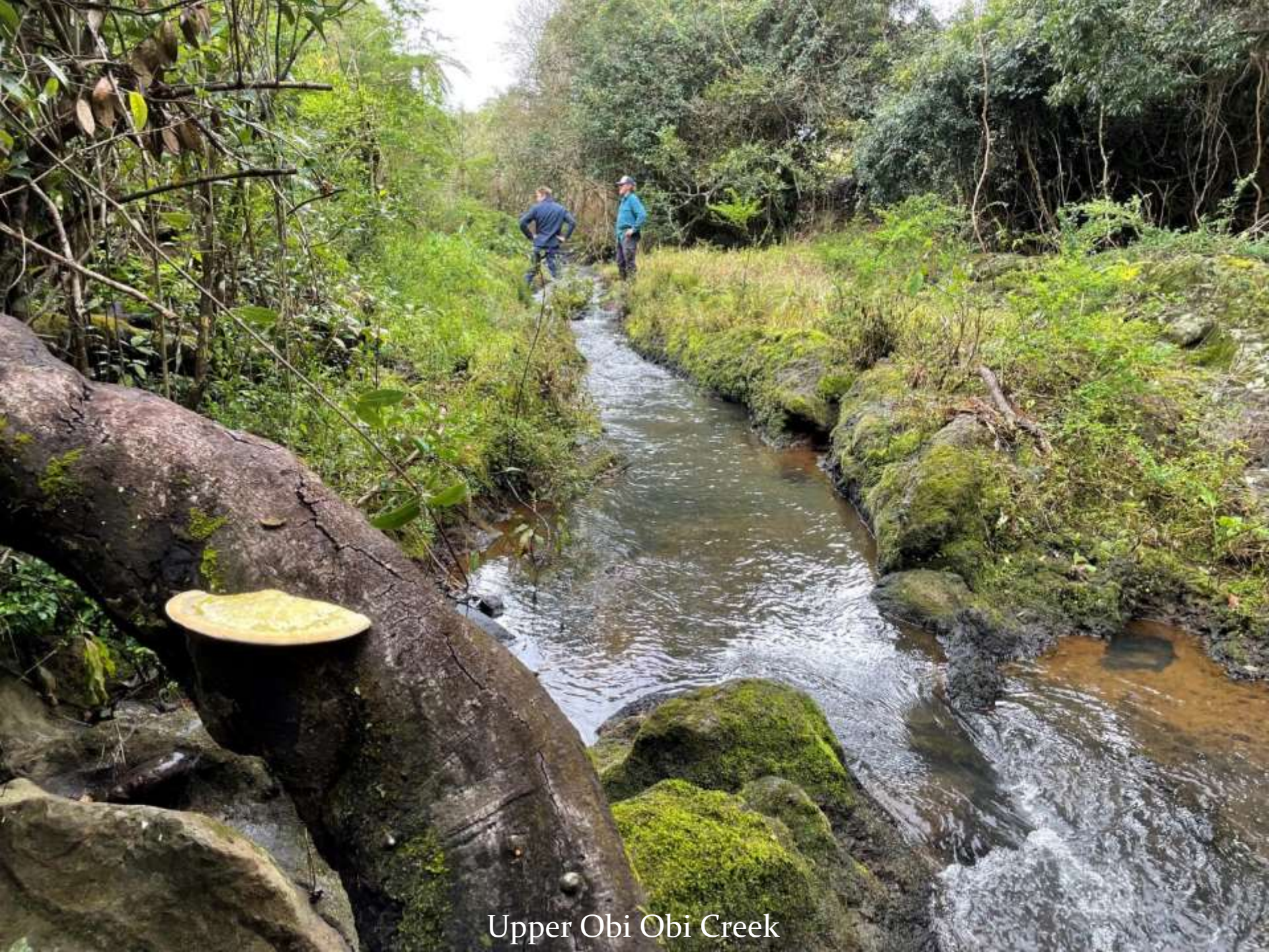
Upper Obi Obi Creek