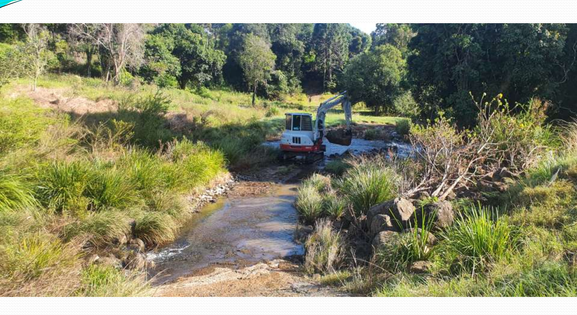
Safety check and repair Obi crossing Nash Excavations