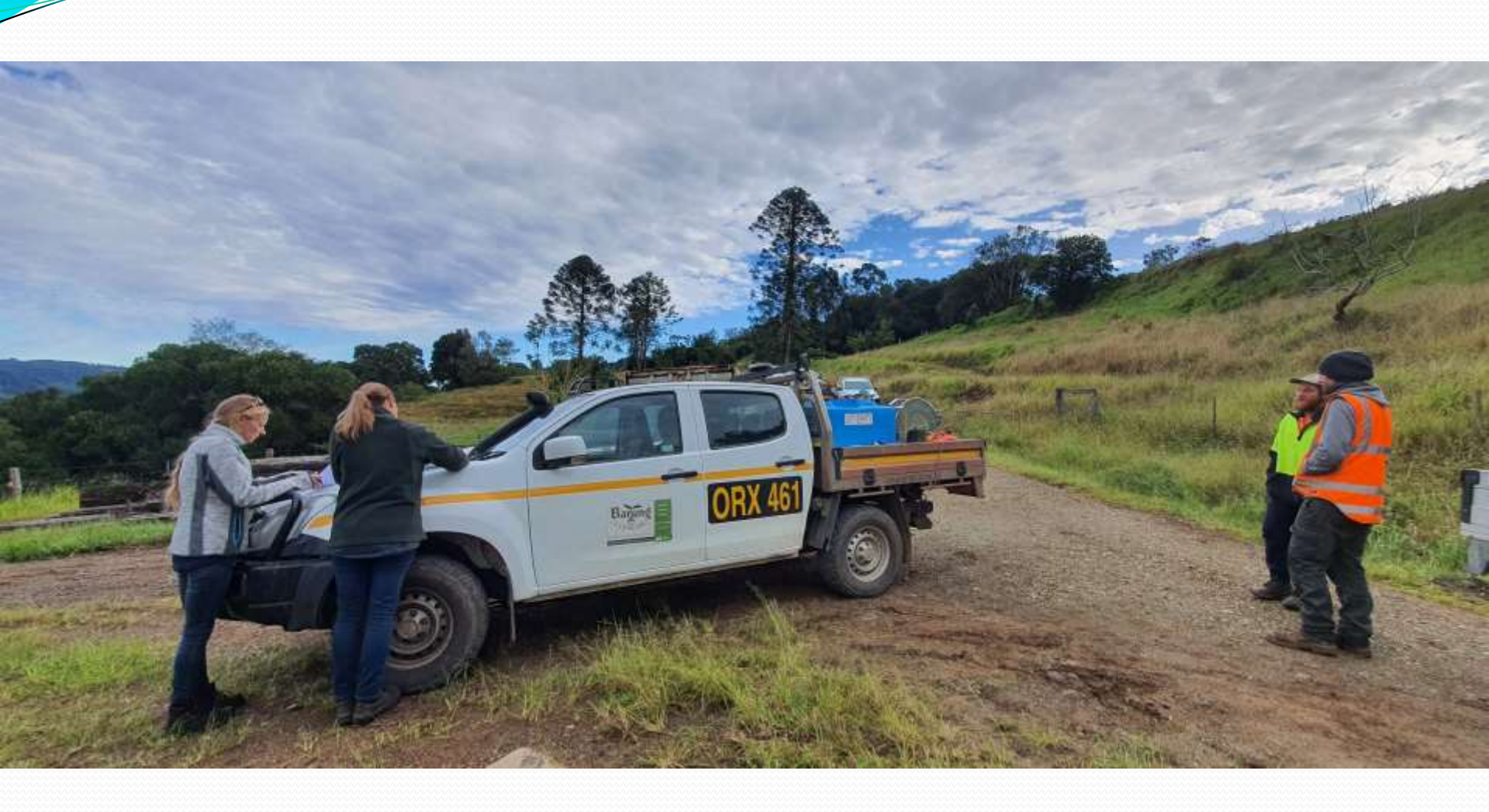
Site induction of Barung and planting contractors