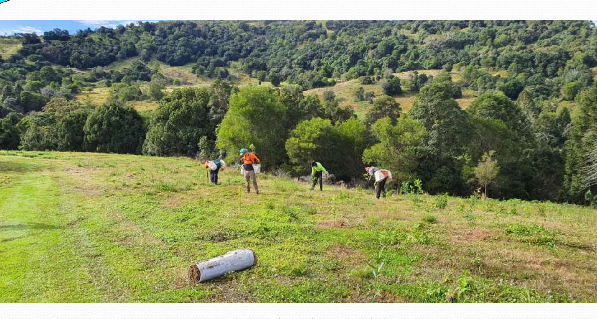
Barung and Seed to tree planting