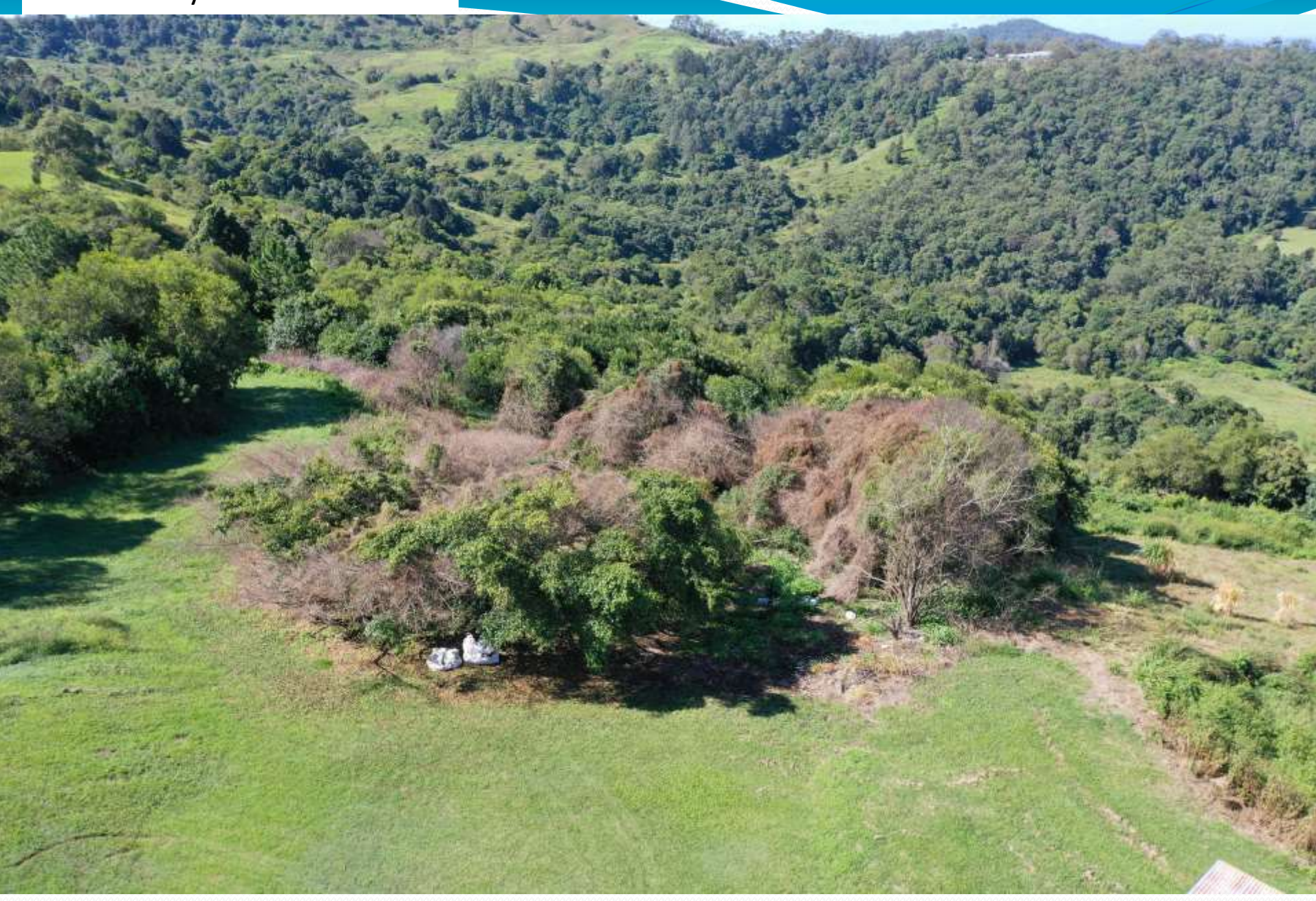
Upper Stanley Madeira management (HLW)