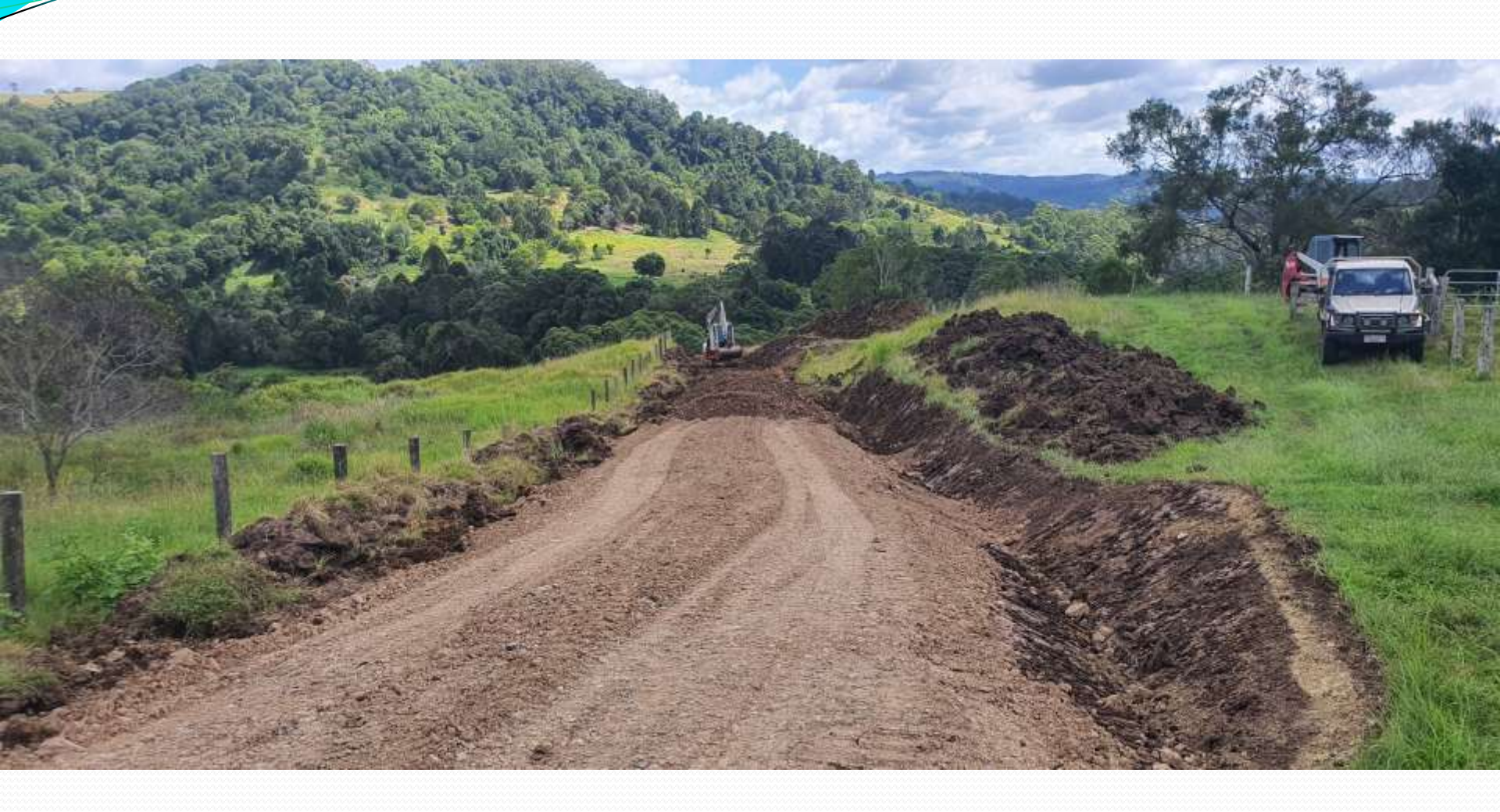
Access tracks repairs Nash Excavations