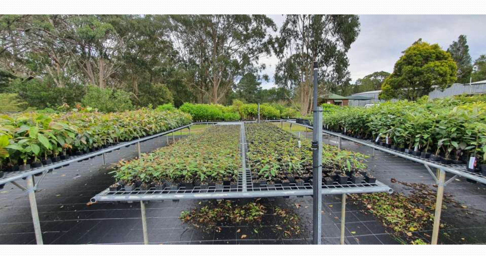
New stock growing at Barung nursery