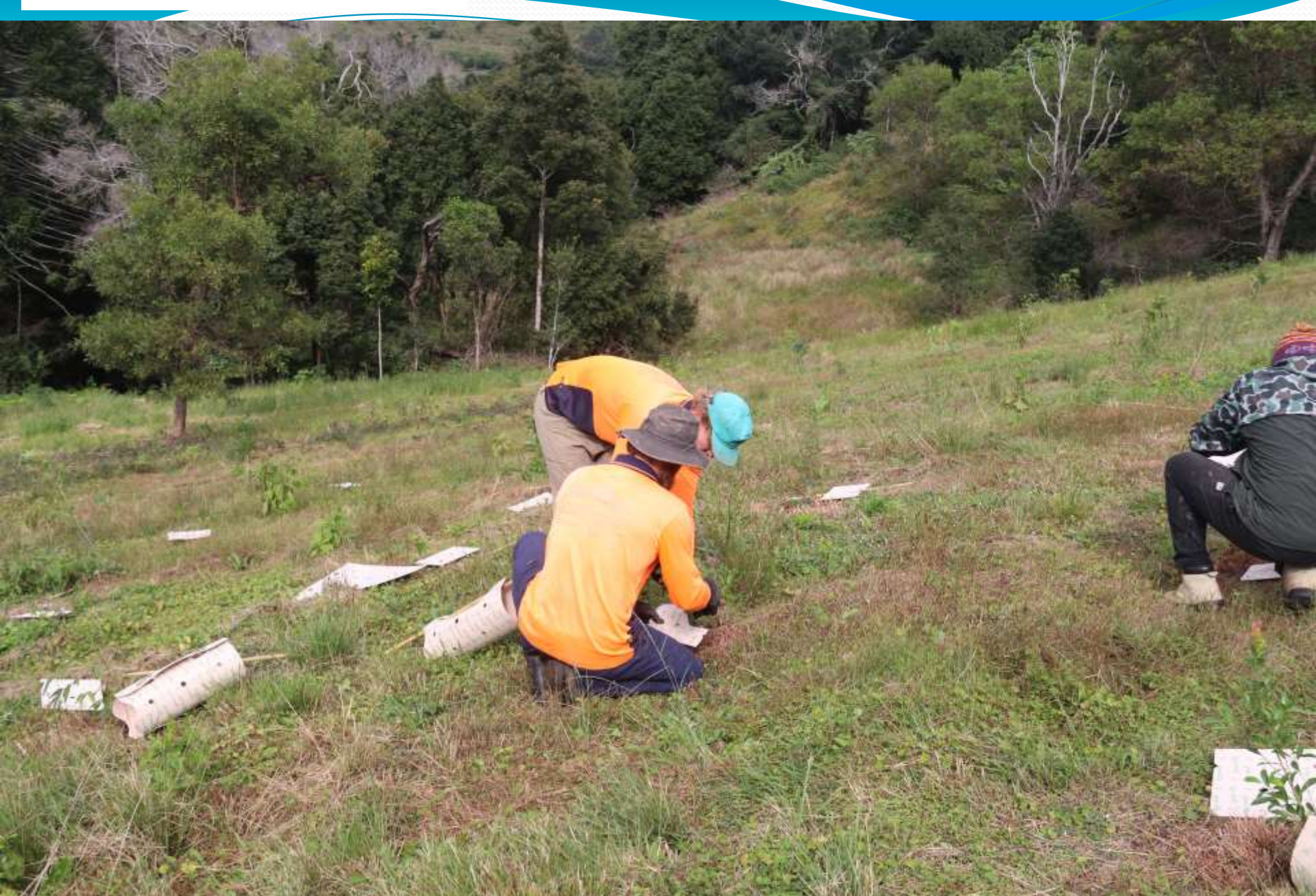
Guarding and matting