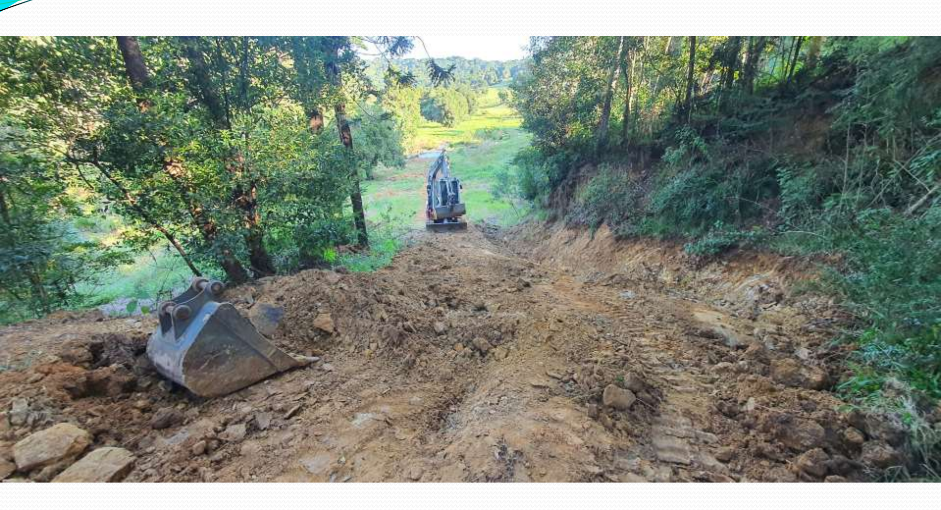
Access tracks repairs Nash Excavations