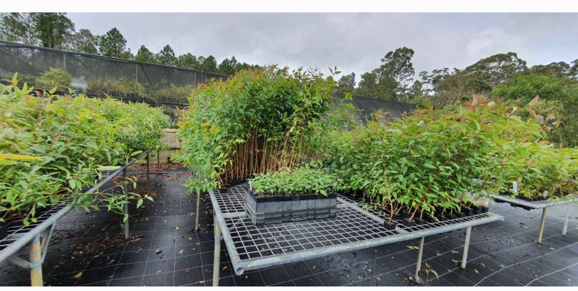
Old stock now replaced at Barung nursery