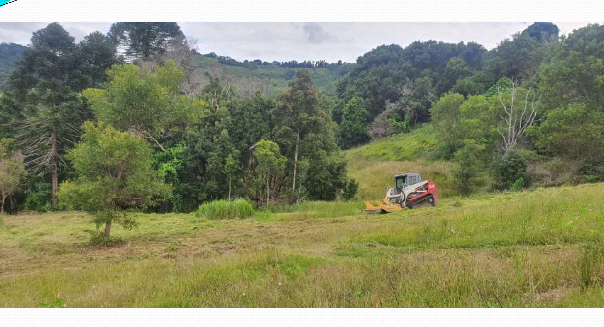
Slashing reveg areas Nash Excavations