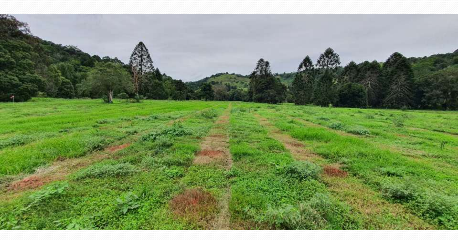
Site prep on the floodplain by LBCCG