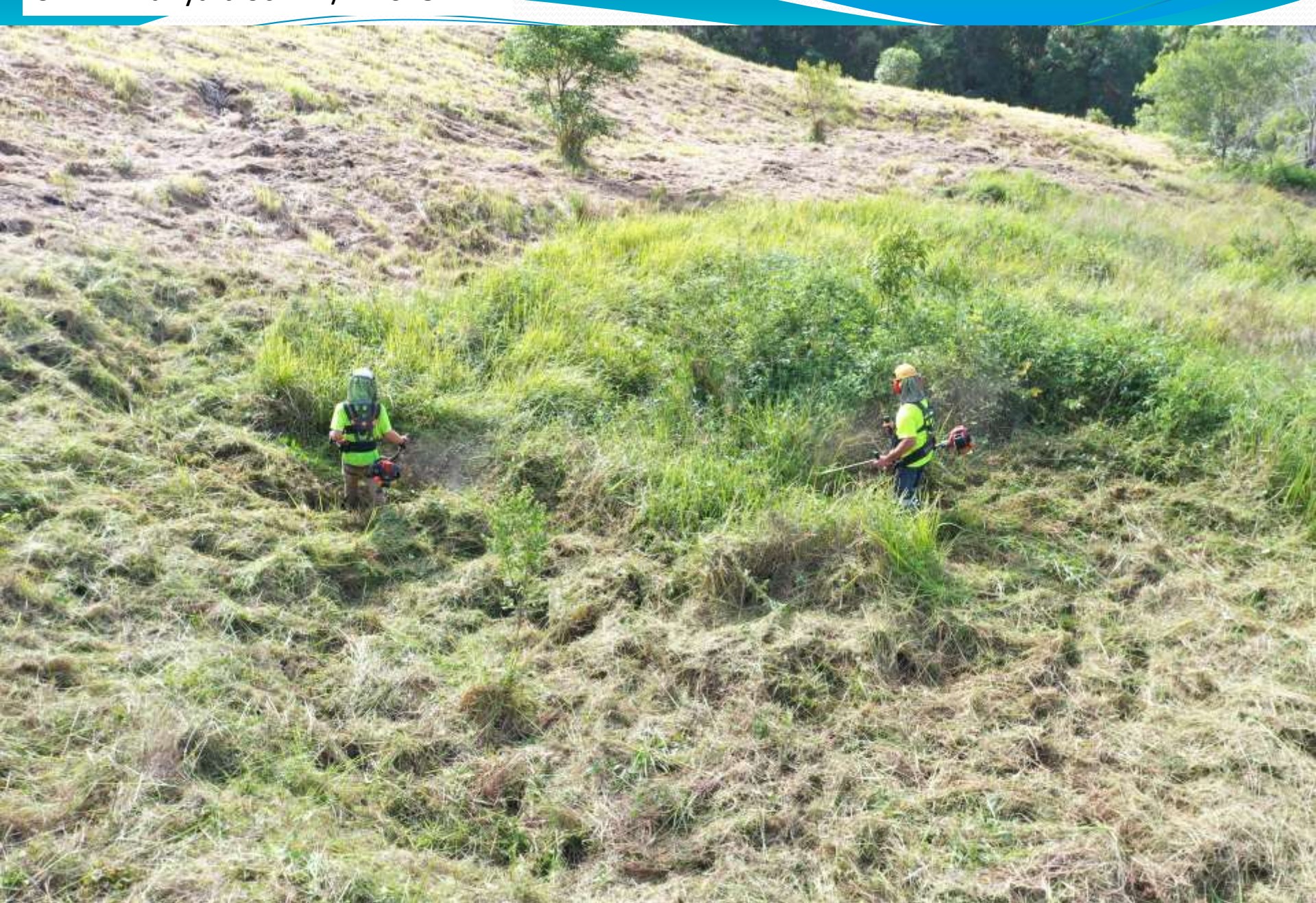
Site prep steep areas Eco clear and plant