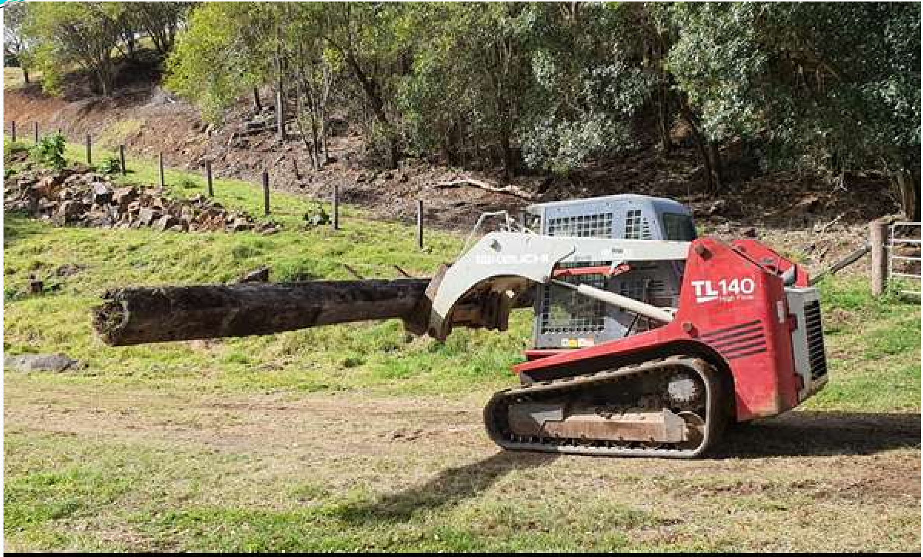
Fence removal - Phil Nash