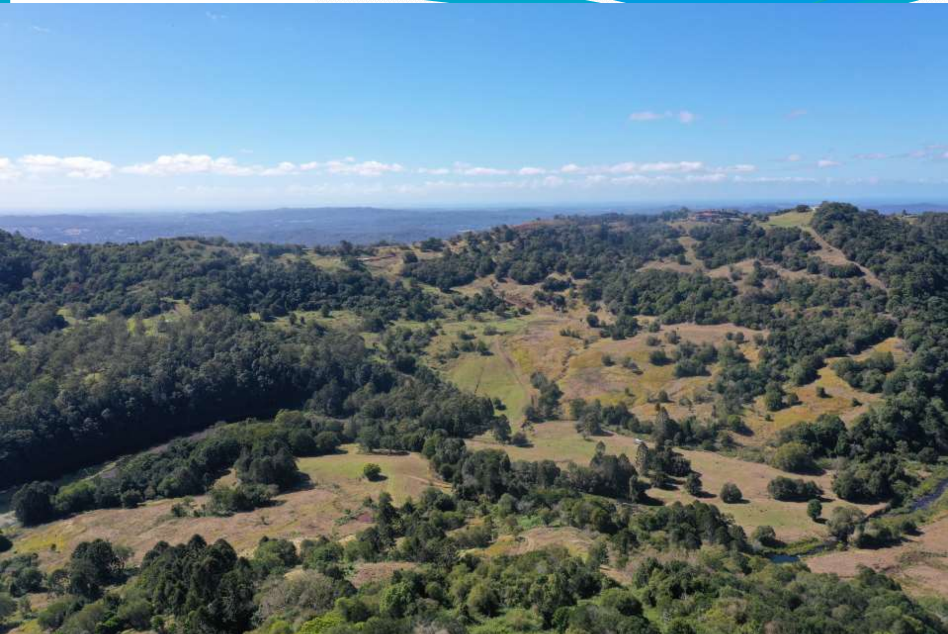
Bunya Block looking east