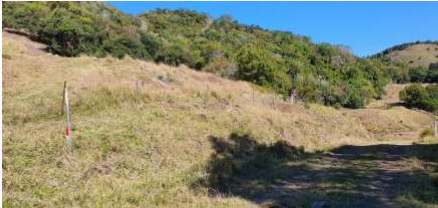
Main track batter works Phil Nash