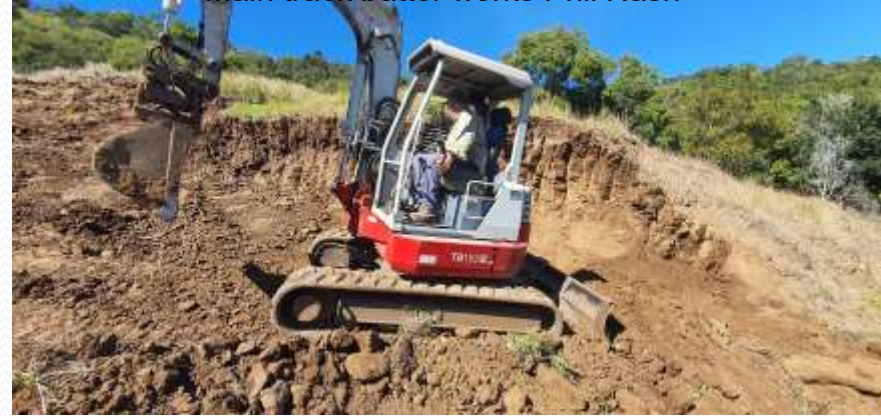
Main track batter works Phil Nash