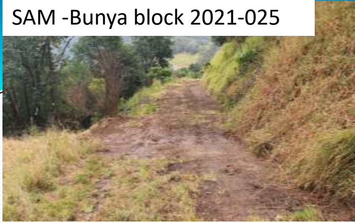
Track works Phil Nash