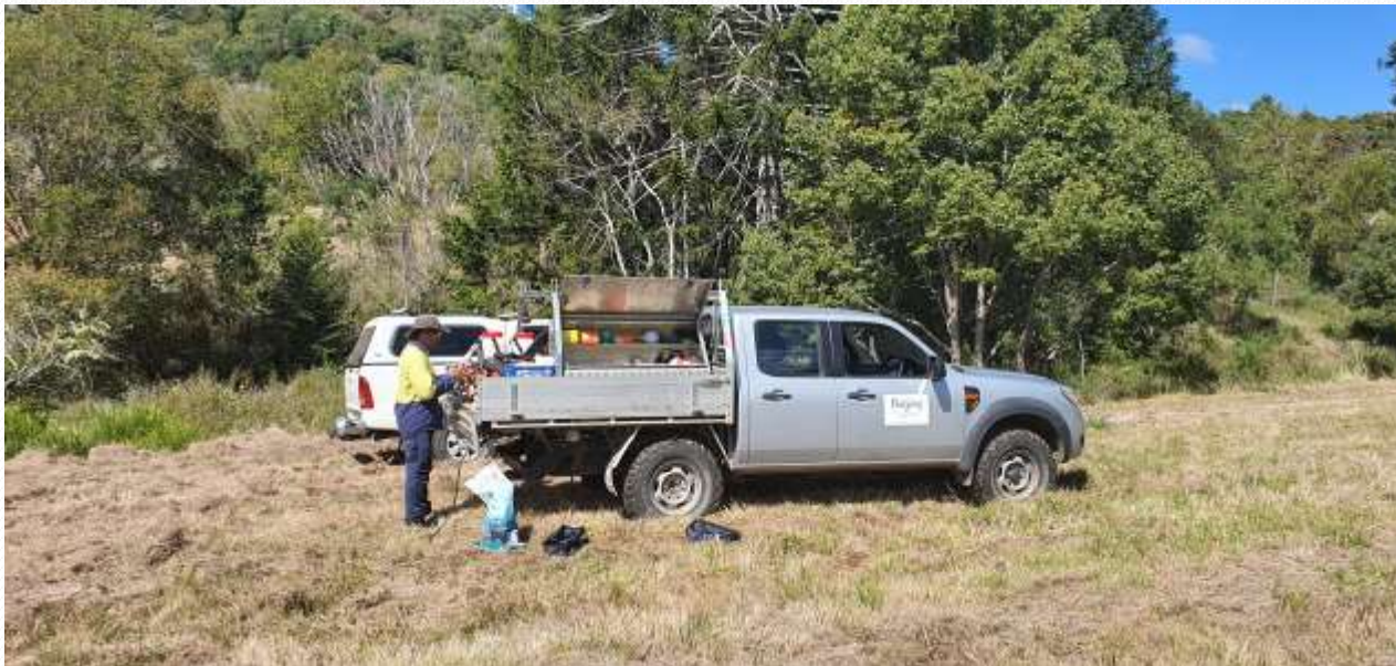
Barung Landcare riparian regeneration