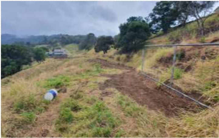
Track works Phil Nash