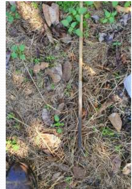
Tree guard and weed mat trial area March 2020