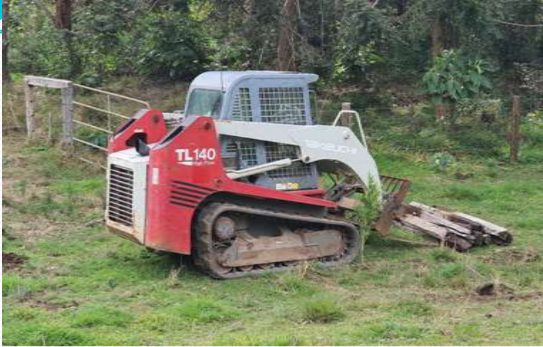
Fence removal Phil Nash