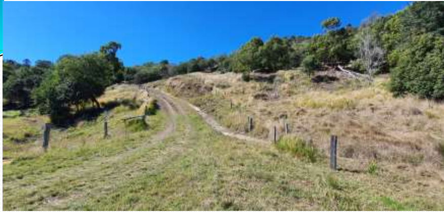
Main track batter works Phil Nash