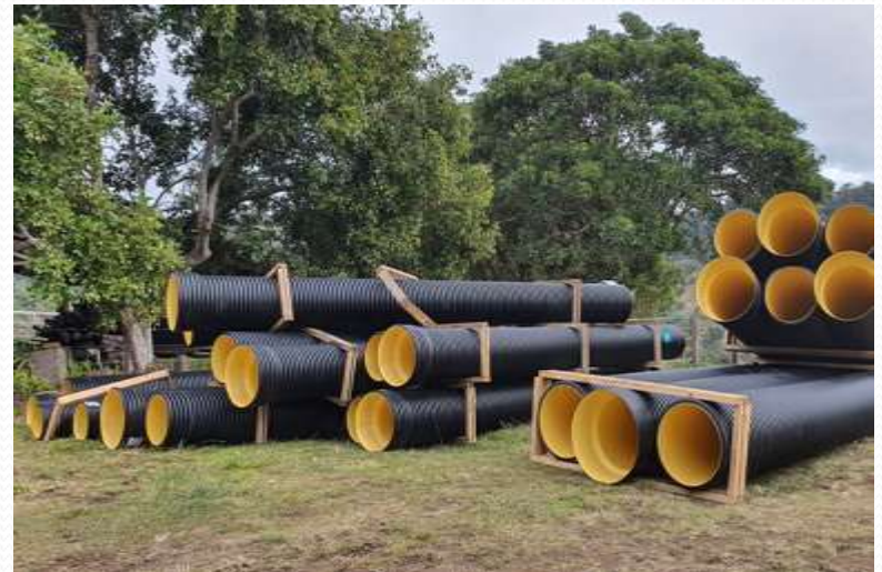
Black max pipes