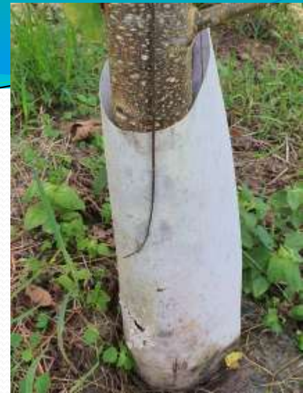
Tree guard and weed mat trial area March 2020