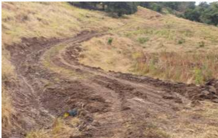
Track works Phil Nash