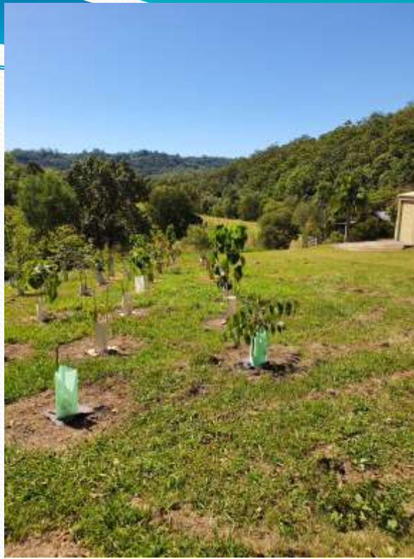
Tree guard and weed mat trial area March 2020