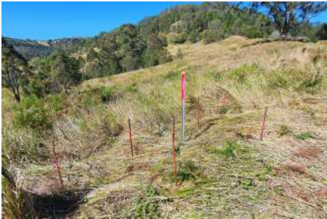
Revegetation trial area 2 Bunya Block