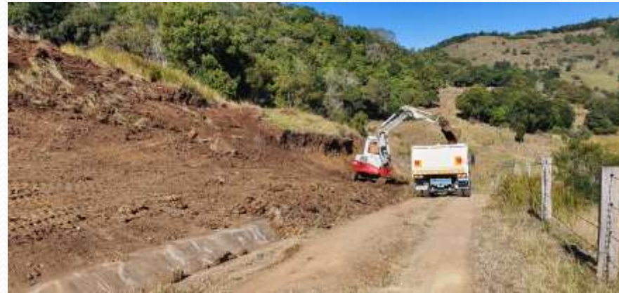
Main track batter works Phil Nash