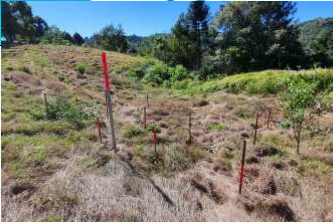
Revegetation trial area 1 Bunya Block