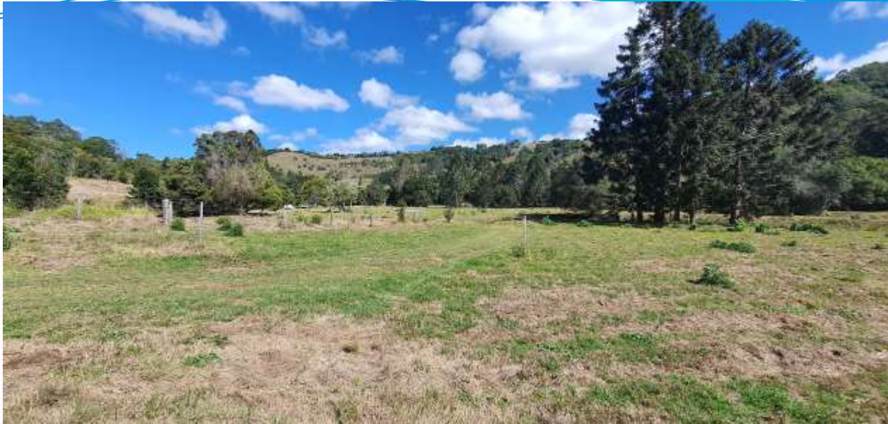
Herbaceous weed treatment (Thistle)