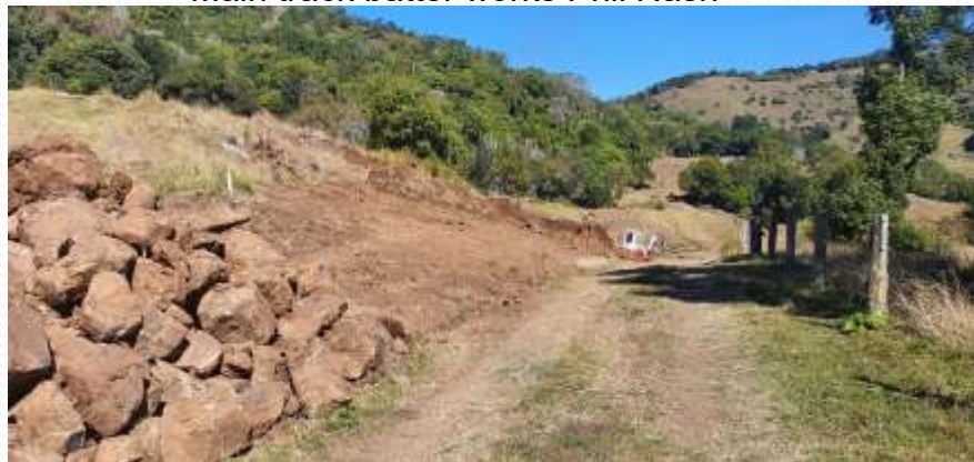
Main track batter works Phil Nash