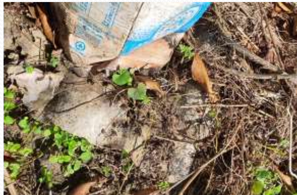
Tree guard and weed mat trial area March 2020