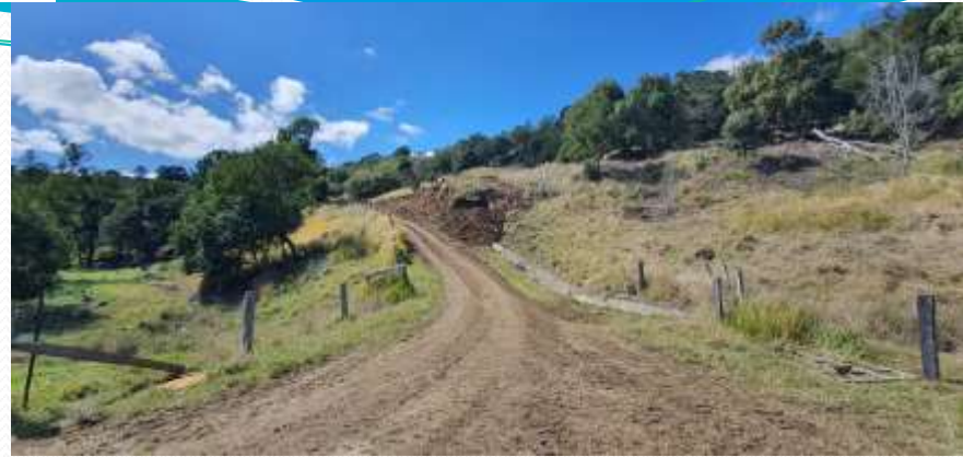
Main track batter works Phil Nash