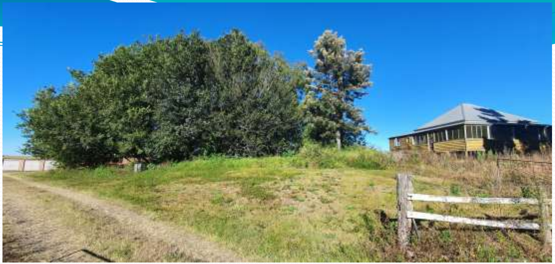
Chinese Celtis Nth Maleny Rd