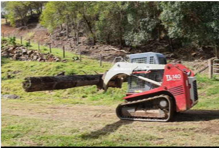
Fence removal Phil Nash