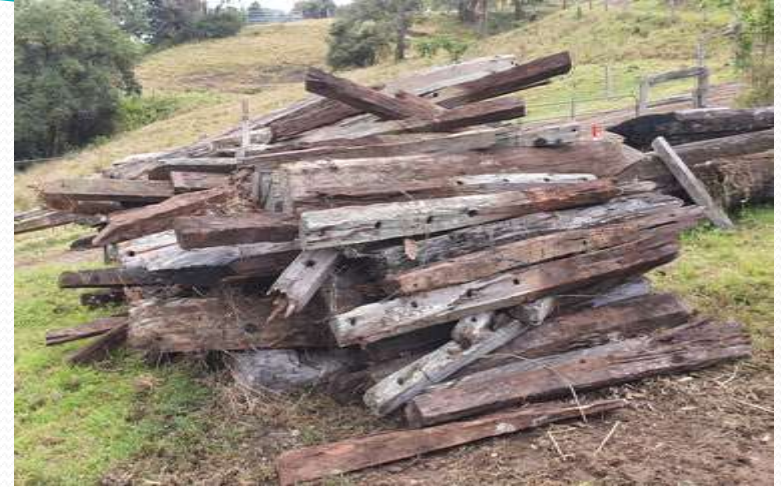
Fence removal Phil Nash