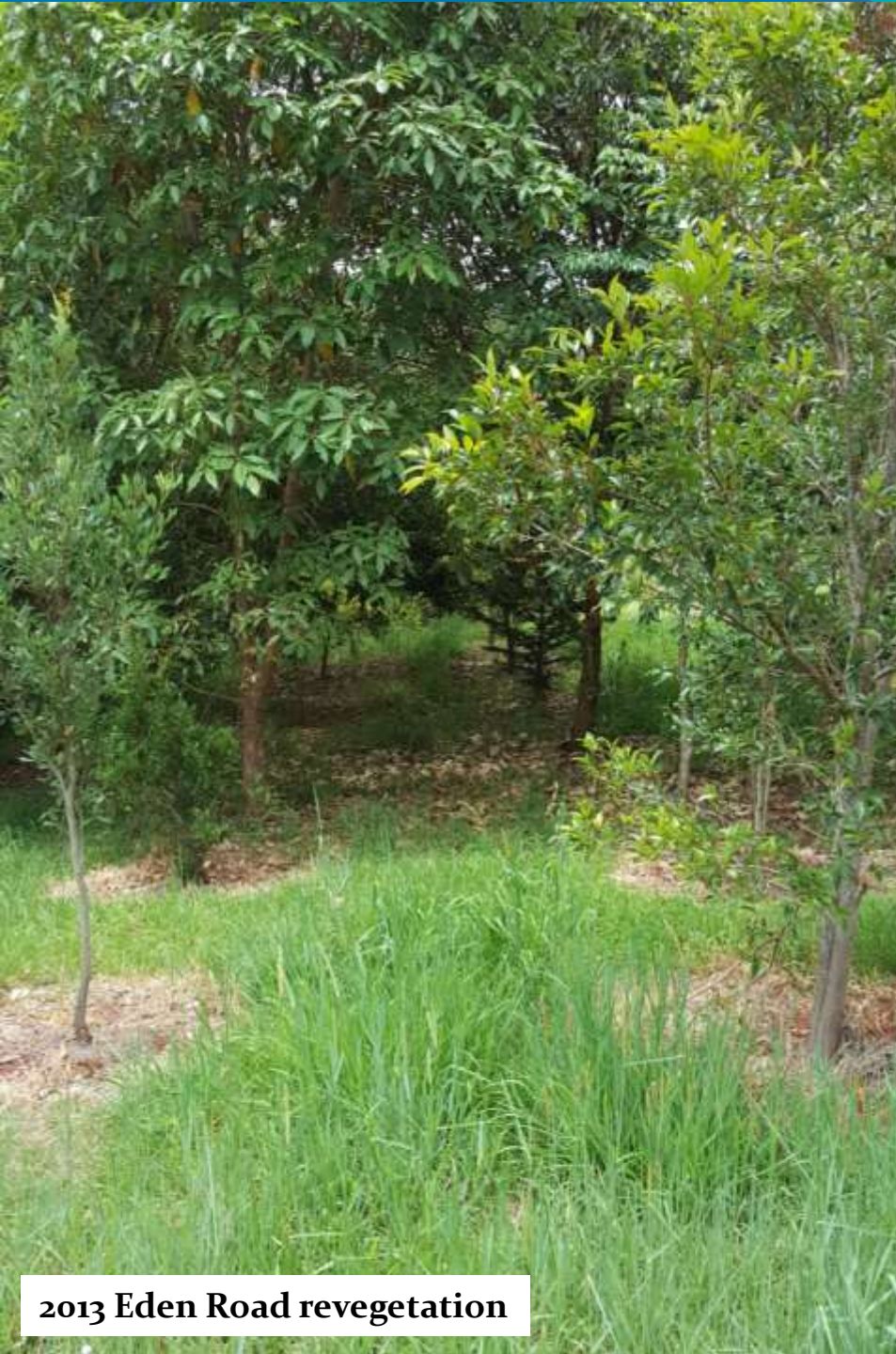
2013 Eden Road revegetation