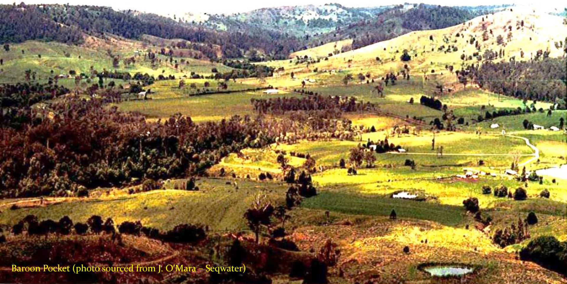
Baroon Pocket